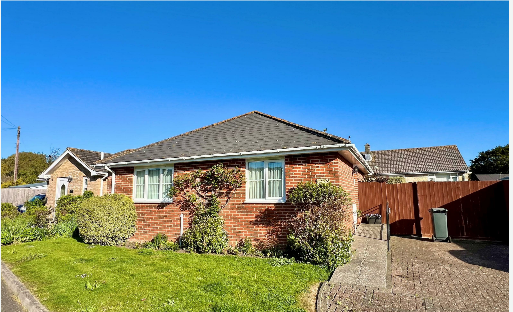
2c Linstone Drive, Norton, Yarmouth, Isle of Wight